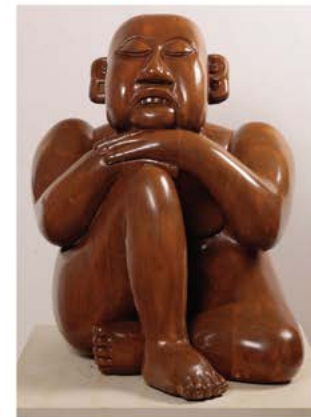
Sitting Shaman #2, from the Council of Shamans series, mahogany, second piece, 29" ht, 18" wide, 23" deep