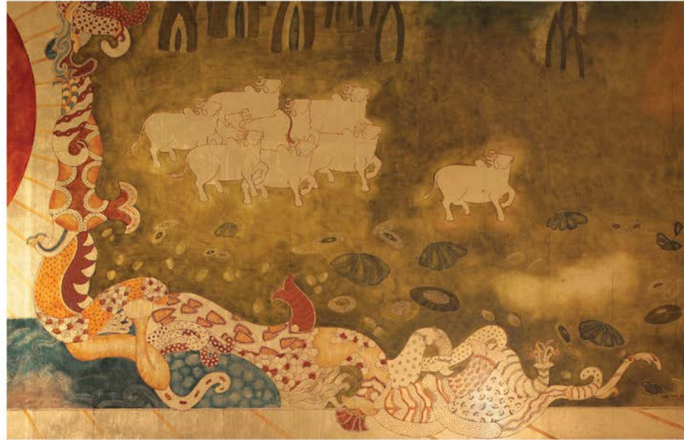
The Divine Path, 2002, mixed media gold leaf and oil, 63" ht. x 119" wide

rial Sculpture Art." Few styles present such originality, as there are no planned sequences or inflexible rules. "I do make some basic sketches, but they have little in common with the final."