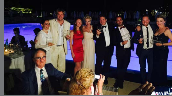
Featured Artist and Award Winners

These suggestions are endless and unique to us all. Allowing each viewer that's been hypnotized a chance to ponder and imagine his or her own birth and travels through life.