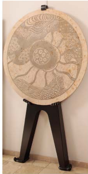
Yin Yang and The Origins of Life, mixed media, acid-etched marble with mahogany base depicting The Creator holding the world. 88" ht. x 51" wide, 2008