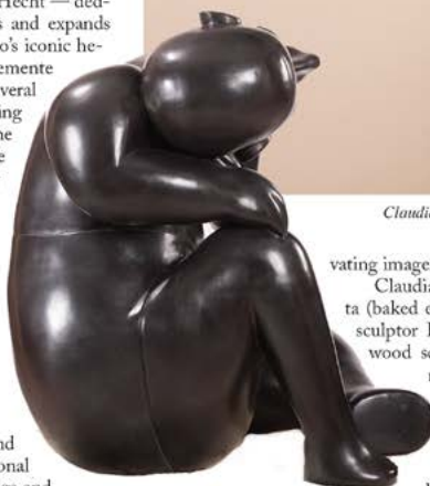
Shaman, bronze, 2014